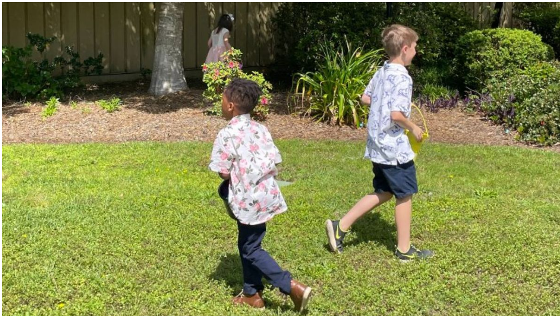
Easter and Holy Week were a fantastic time here at All Saints! Pictured are our events on Easter Day which included an Easter Vigil, Brunch, an Easter Service, and an Egg Hunt!