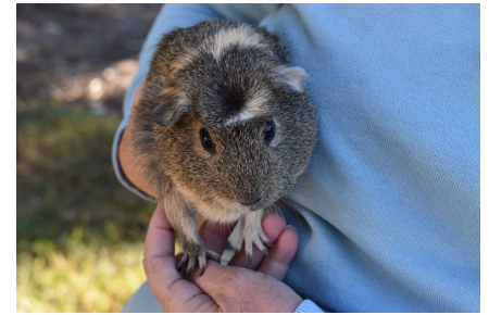
From a hamster....