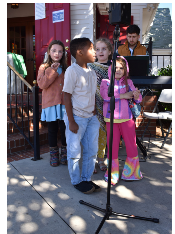
And Children's Choir, too ...