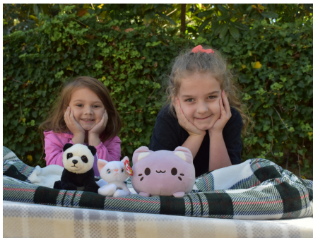
To favorite stuffed animals...