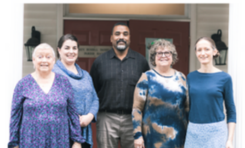
Advent at All Saints, with Coffee Bar Fellowship