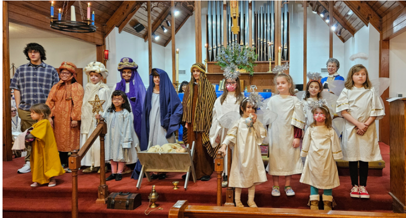
Annual Christmas Pageant

Helping our neighbors: by creating 200 care packages for our homeless brothers and sisters in Warner Robins