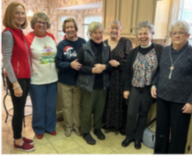
Ladies Lunch Bunch at the McFall's home