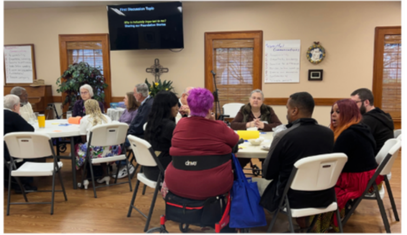
Gathering in Community: Real Issues Speaker Series, Talking about Inclusivity