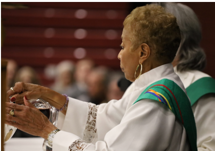
Our saints from All Saints at Annual Council Worship