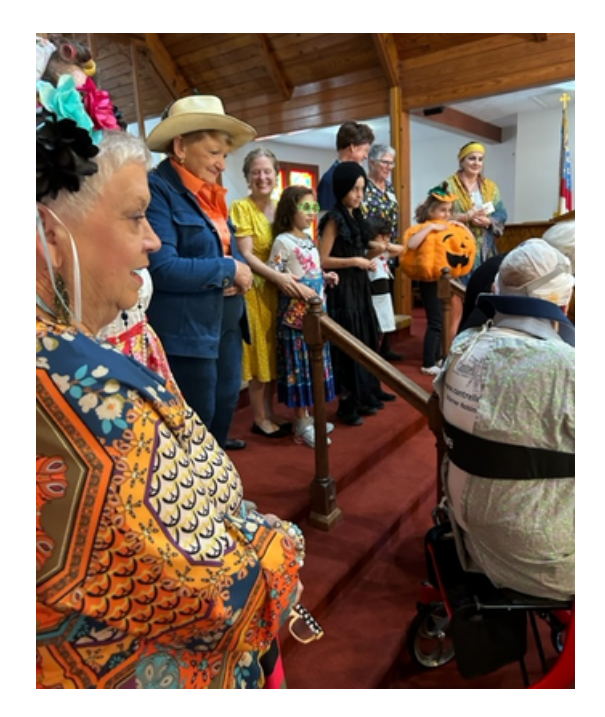
The Joy of Blessing of the Costumes . . . for ALL ages