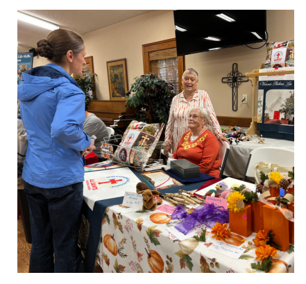
So many vendors, selling their wares!