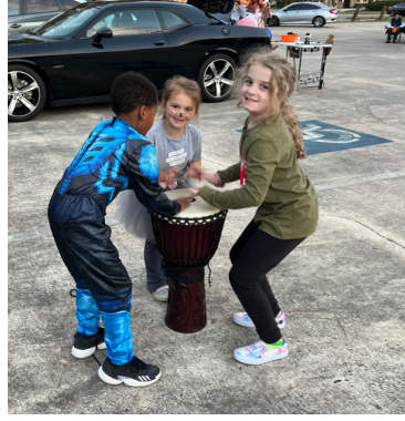
Marvelous Trunks, Creative Costumes, and even a Music Corner . . .

Activities and Fun for Kids of All Ages!